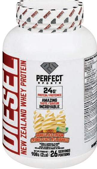
Diesel New Zealand Whey Protein 908 g, Assorted