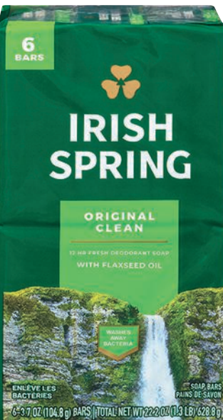
Irish Spring Bar Soap 6 x 104.8 g