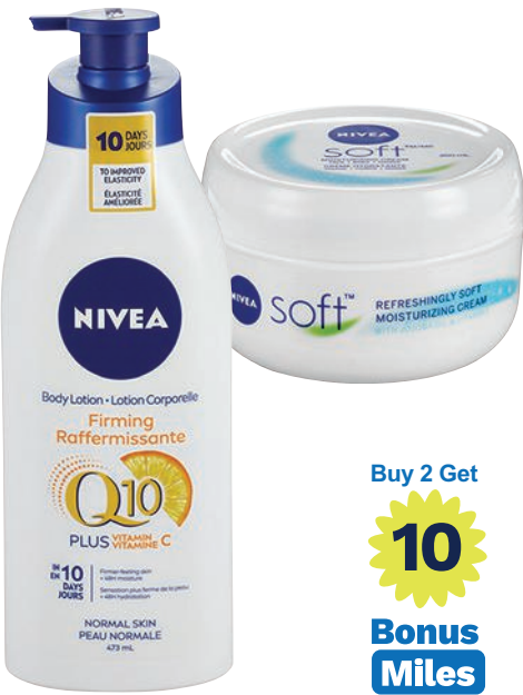
Nivea Body Care Products 100 – 625 mL, Select Types