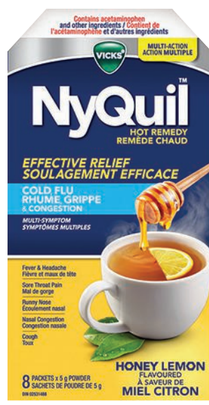
Vicks Powder Pack 8's