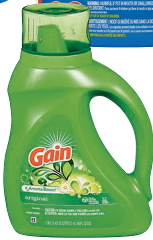
Tide Pods 12 – 16's, Downy Liquid 1.31 L or Gain Flings or Liquid 1.36 L