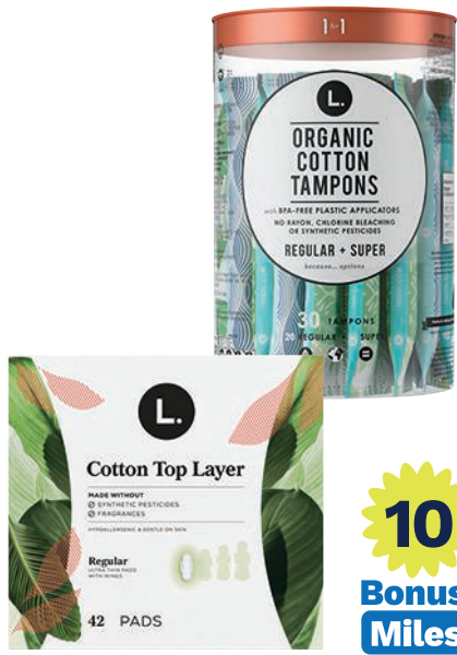
L. Tampons 30's, Ultra Pads 36 – 42's or Liners 100's