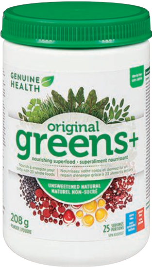
Genuine Health Greens+ 208 – 228 g