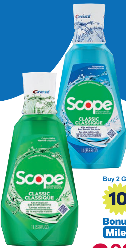
Scope Classic Mouthwash 1 L