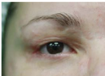
Figure 2. Patient facial scars (before PracaSil-Plus)

After 3 weeks of treatment, the patient was surprised by the softening of her skin and overall improvement of her complexion (Figures 2 and 3).